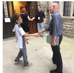
People were directed by 11th and 12th grade boys in the

This past Sunday was our first go at it, and it was beautiful to see many of our kids take the challenge head-on.